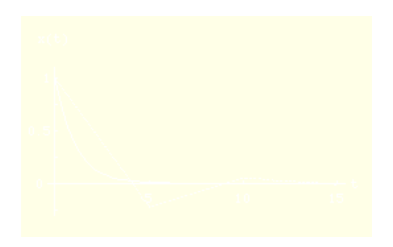
Figure 3. Optimal LQR trajectories

The optimal trajectory for the linear quadratic regulator (LQR) problem, starting at x_0=1 , for continuous time (solid line) and for discrete time with time steps of duration 5 (dashed line). In continuous time, the optimal speed is high when x=1, and the speed decreases as x approaches zero. In discrete time, the optimal speed is lower initially, to decrease the amount of overshoot on the first time step.